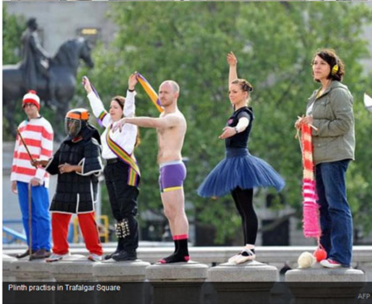
Plinth practise in Trafalgar Square