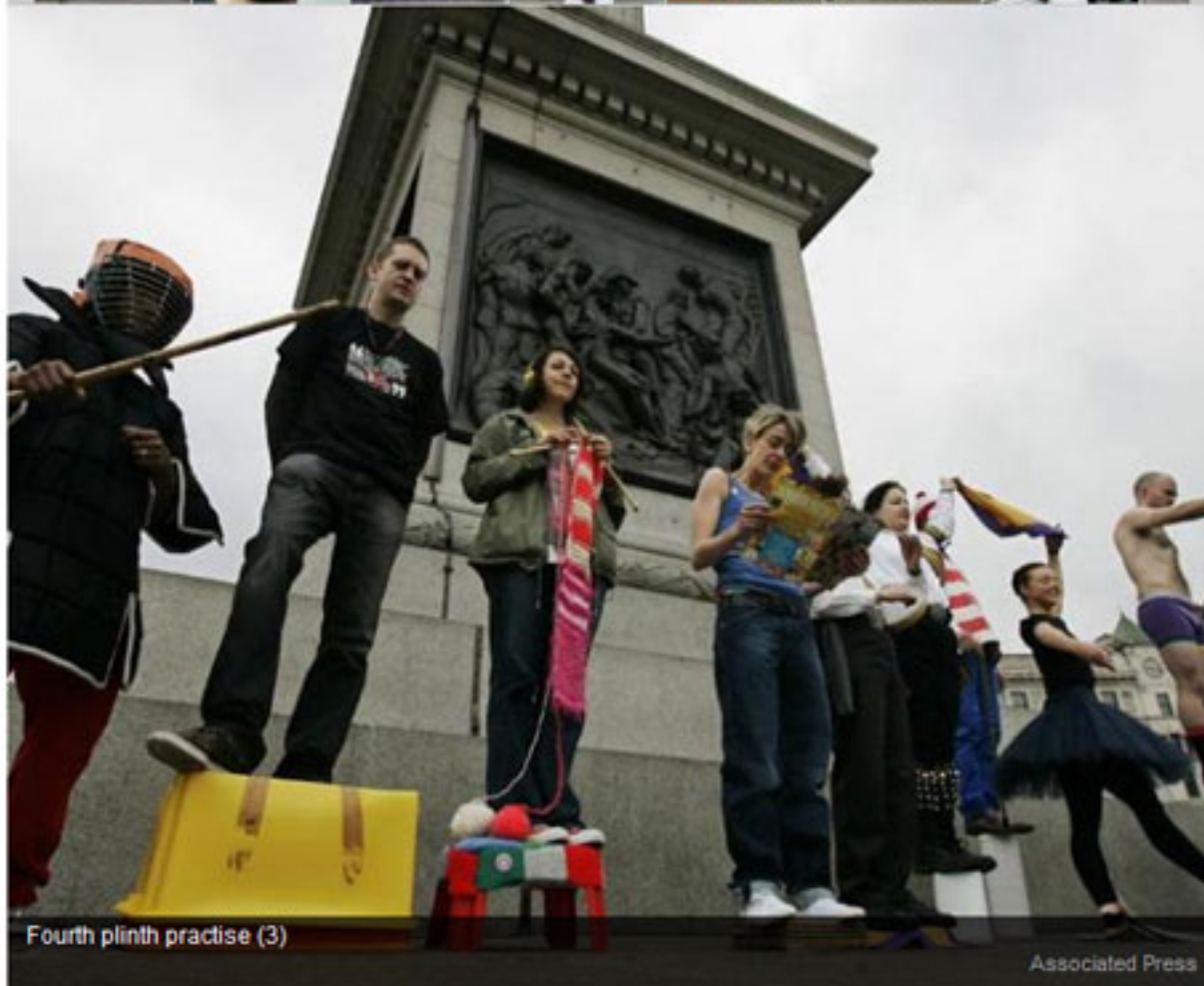
Fourth plinth practise (3)