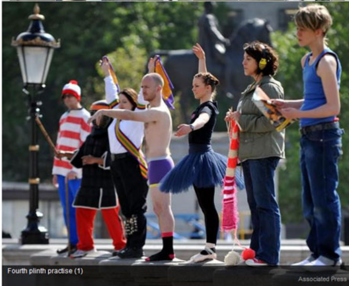
Fourth plinth practise (1)