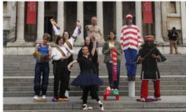
Antony Gormley meets applicants for his One & Other fourth plinth project